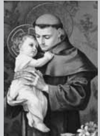
St. Anthony of Padua

Masses: Saturday 5:00 p.m. Sunday 8:30 a.m.